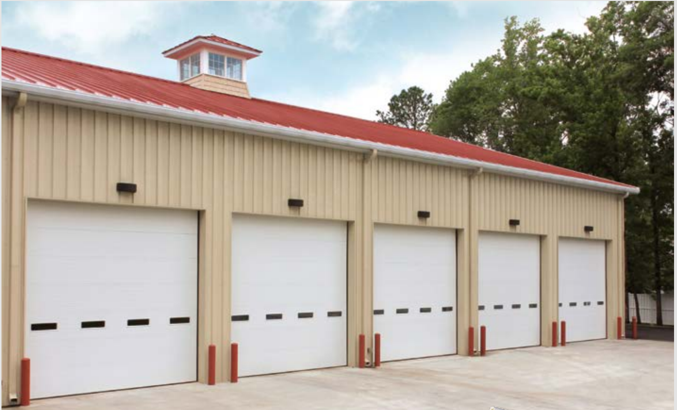
Model 3724, 14'2" x 14' doors; shown with 24" x 8" Lites